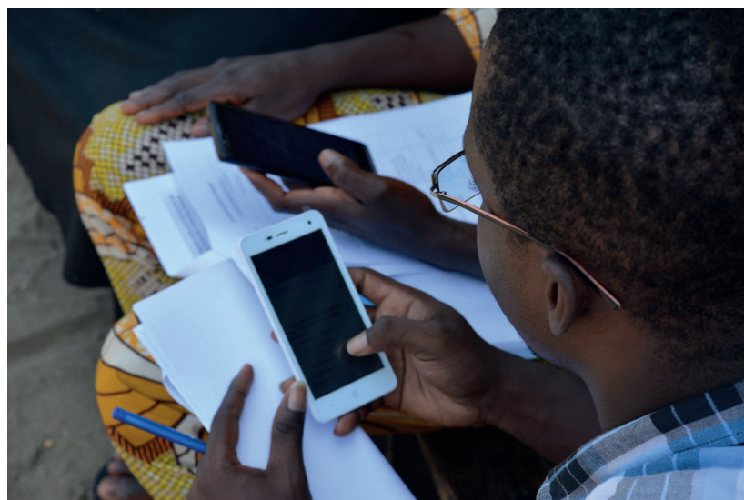
Collecting survey data for a national water integrity and governance assessment for Benin, 2017