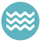
River basin organizations